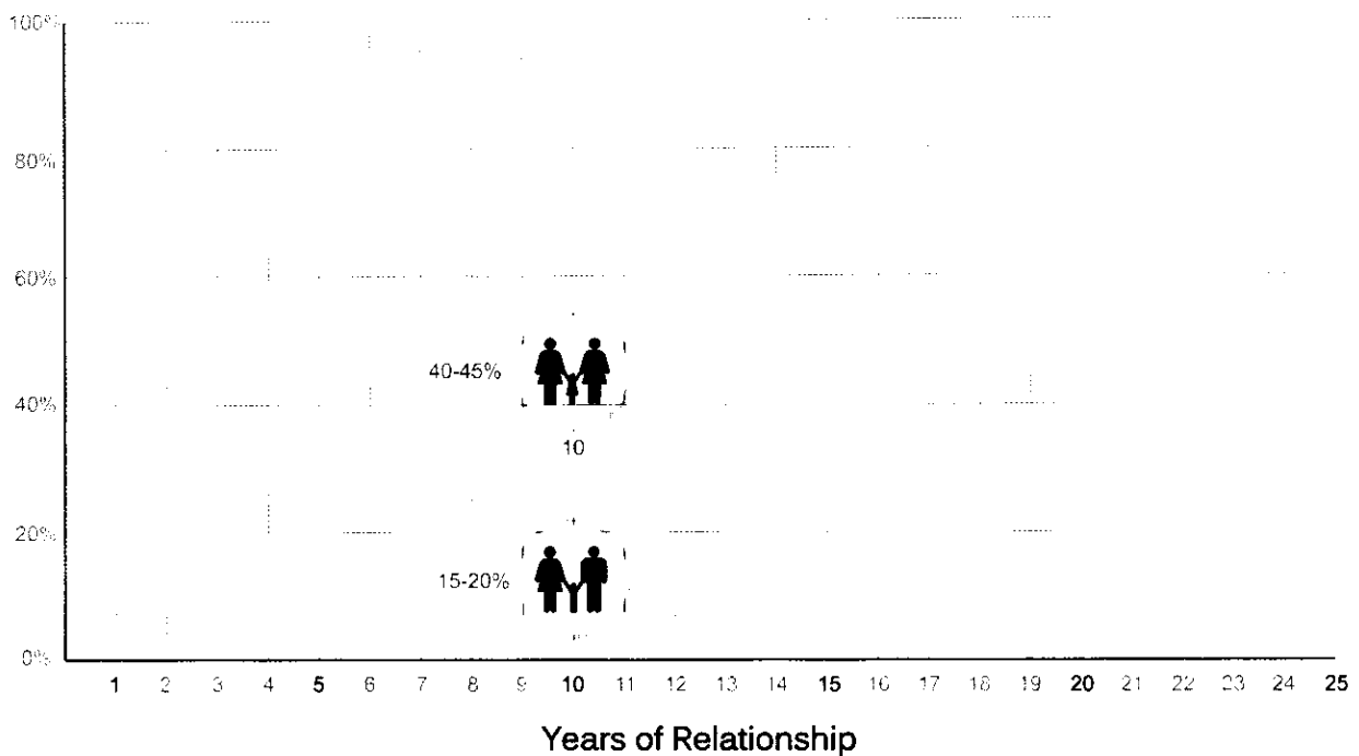
Average Separation Rate for Two Female Parents with Comparison Group of Opposite-Sex Parents

Across these four studies over similar periods of time, it appears that the odds of lesbian couples breaking up are over three times greater than the odds of heterosexual couples breaking up. Regardless of methodology used, it appears that 15% to 20% of heterosexual parents are likely to break up by 10 years compared with about 40% to 45% of lesbian parents. 9